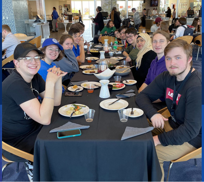
Participants in the BlueSky Tennessee Institute program

From their earliest days as teachers' colleges, regional public colleges and universities have focused on being the workhorse institutions that provide their local economies with the professionals they need. They still produce teachers, nurses and the like, but today, that increasingly means producing graduates with technology skills.