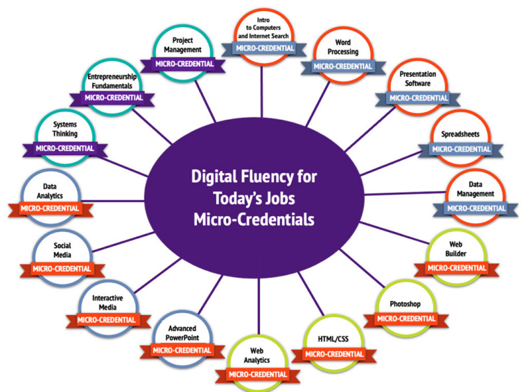
Austin Community College's digital fluency microcredentials

Aligning curriculum with workforce needs is a top priority of late for some forward-thinking institutions. In an era in which many if not most jobs have a digital component , Austin Community College formulated an innovative solution: offering stackable microcredentials as part of an initiative centered around digital fluency.