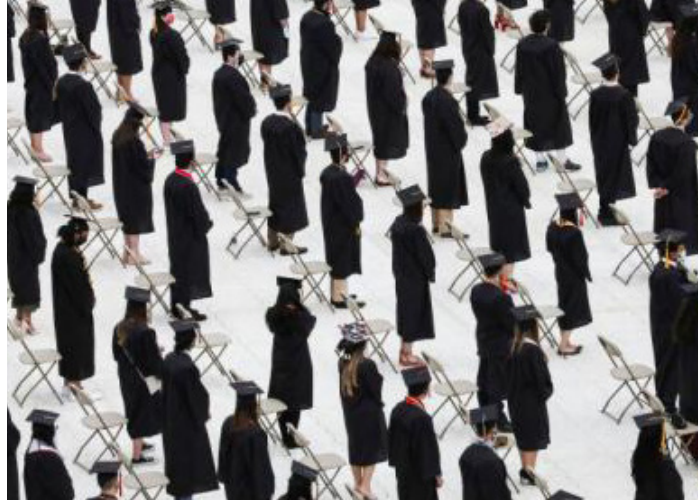
Soon-to-be graduates from Northeastern University attend commencement.