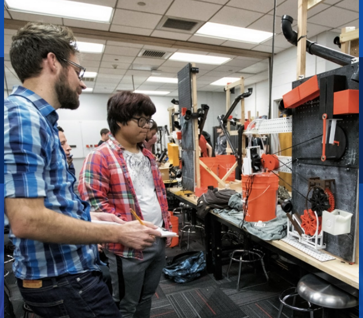
Mechanical engineering students at Utah Tech

Skepticism about the value of a college degree is growing, despite plenty of evidence that degree-holders earn more and are more recession-proof than peers without a degree. In response, many institutions are considering adding certificates and microcredentials to respond to what Ryan Craig calls “faster and cheaper alternatives to college.”