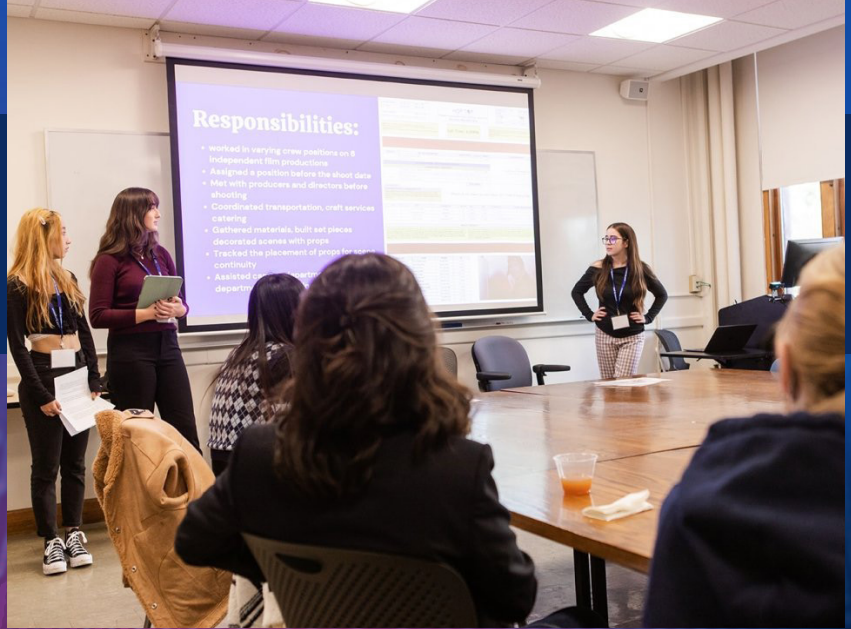
A Mount Holyoke student shares experiences from her Lynk-funded internship with peers.

As more consumers question the value of higher education, some liberal arts institutions struggle to persuade prospective students that their degrees will pay off in the workforce (despite plenty of historical evidence to back that up). Some liberal arts colleges are thinking outside the box of ways to change the narrative.