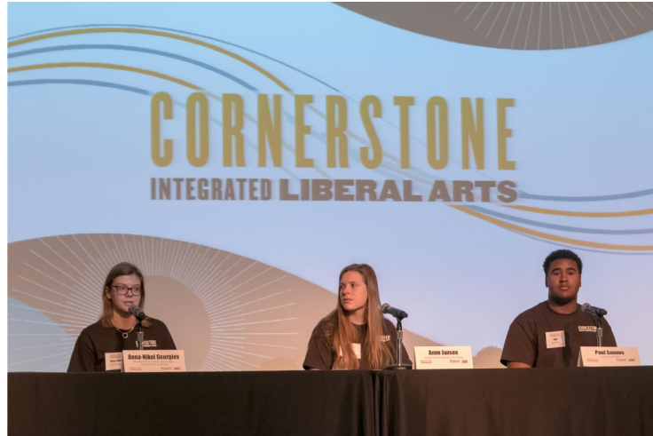
The second Academic Advisors' Lunch in 2019. Three students who had taken Transformative Texts talked to the advisors about how the courses helped them grow.

In the pilot phase, Cornerstone offered six sections of SCLA 101 (Transformative Texts I) in fall 2017 and four sections of SCLA 102 (Transformative Texts II) in spring 2018. By fall 2018, all 33 sections of Transformative Texts filled with 997 students, seeking to fulfill their oral and written communication requirements. In Fall 2023, Purdue is projected to offer 132 sections of Transformative Texts and enrolling over almost 4,000 incoming students.