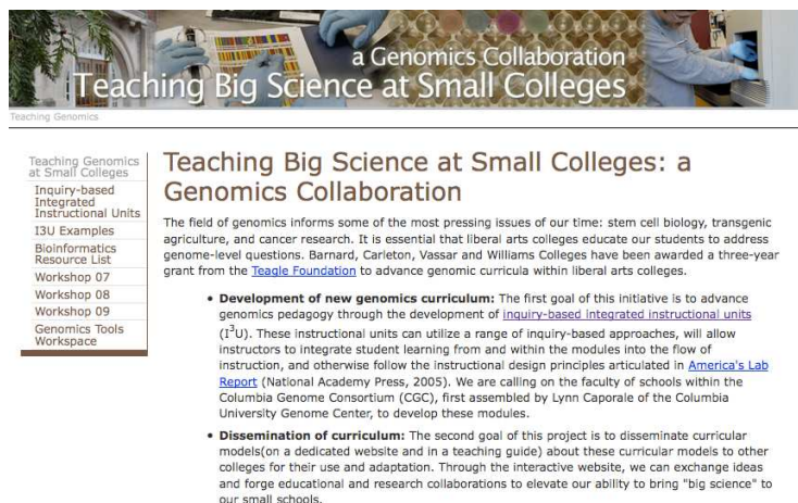
Figure 2. Screenshot of the project homepage.

The full workshop program and a complete set of Powerpoint presentations from 2007 are available at http://serc.carleton.edu/genomics/workshop07/program.html . At the workshop, participants worked in small groups to design four new instructional modules. One of these, on microbial diversity in soil, now forms the basis for a multi-week course lab at Williams and has also been implemented at Vassar. A second, which integrates anatomical and genomics tools to study nervous system evolution, was expanded into a full I 3 U by a team from Vassar and Whitman colleges and implemented at both colleges. Each of the four model I 3 Us were designed within the framework we had established, using an online form provided by SERC on our project website to facilitate concrete definition of learning goals, appropriate course-level context, teaching plan, and assessment plan (Appendix 3). Pre- and post-workshop assessment surveys documented substantial gains in 10 of our 11 workshop goals ( http://serc.carleton.edu/genomics/workshop07/goals.html ), and open-ended responses indicated that the workshop was quite successful. Based on their experiences at the first workshop, four individuals and four teams of participants submitted proposals for summer stipends and supply money to develop I 3 Us (see Appendix 4 for the request for proposals form).